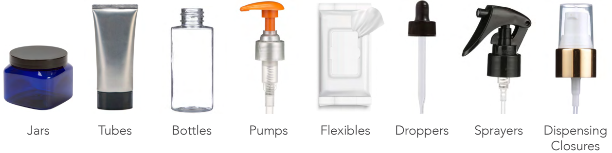
Jars Tubes Bottles Pumps Flexibles Droppers Sprayers Dispensing Closures

From dispensing closures to tubes, we can source all your packaging needs for your new or refreshed product line.