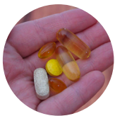
Pills, Vitamins & Supplements